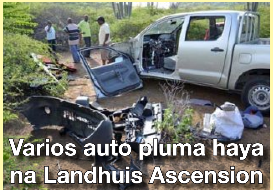
Varios auto pluma haya na Landhuis Ascension

Outoridatnan mester a bai topogigo ayera atardi lat pa kaso kaminda deskonosi a drenta i atraka e persona nan ku ta traha na e luga aki menasa nan ku arma i ranka kaha di plaka bai kune na pia. Bastante te outoridatnan ku a bai e sitio i a kuminsa hasi un buskeda basta grandi pero no por a bin dal den e tipo aki. Atrako Team a keda ke investigashon.